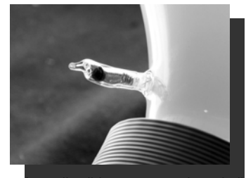
A small solid mercury amalgam ball is easily and safely snapped off for recycling. Magnets are recyclable metal, and the remainder of the bulb is disposable glass.

Gem-Bright™ technology provides a major environmental feature that goes beyond lighting. Today’s environmental awareness and our sustainability needs are addressed by the “Green” nature of MIL fixtures. Unlike fluorescent bulbs and other lighting that uses dispersed mercury, MIL bulbs employ an encapsulated solid mercury amalgam slug that can be clipped and recycled. There are no PCBs or circuit boards like LED lamps. MIL glass bulbs are 100% recyclable. Even the induction magnets can be sent back to Ultra-Tech™ Lighting for recycling or simply disposed of as metal.